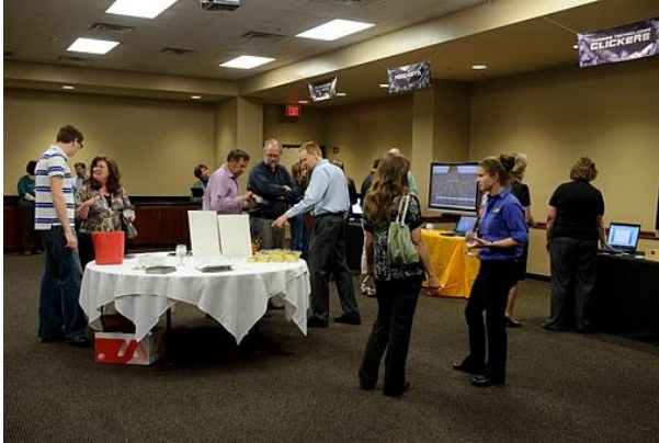
The Faculty Showcase