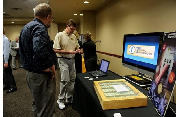
Clickers in Pharmacy