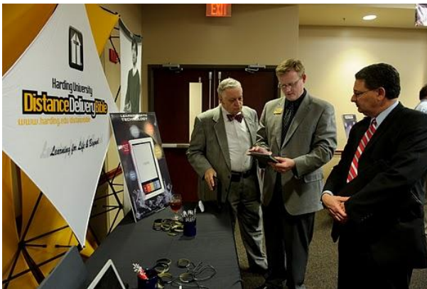
Distance Learning - Bible