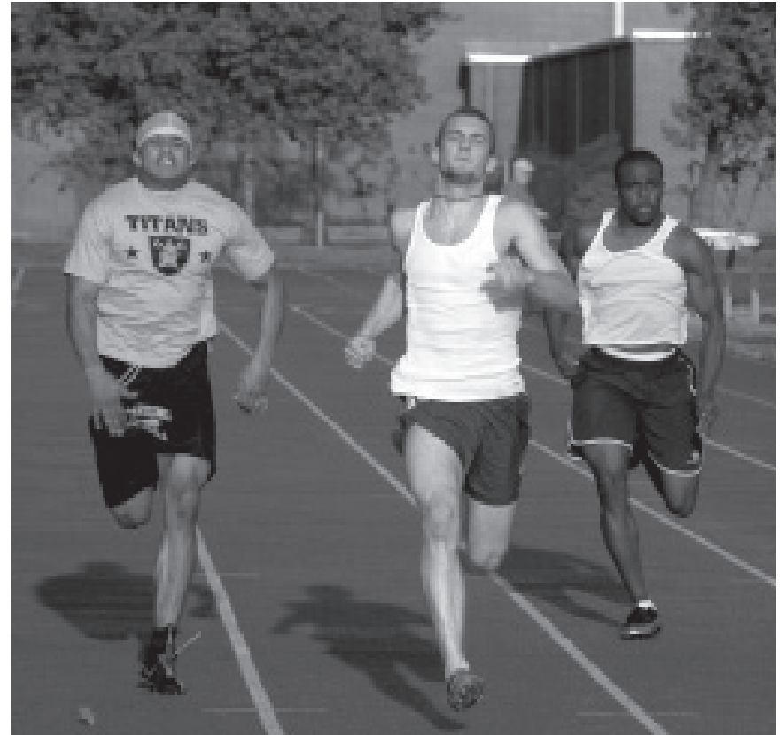
Participants hit the track for the annual cross country race, one of the required events for intramural points leading to earning a letter jacket in the intramural athletic program.

1. Games will last 50 minutes or five complete innings, whichever comes first. Innings will be completed even if the time limit has run out. A and B championship games will last five innings (with the run rule in place). See Rule #8.