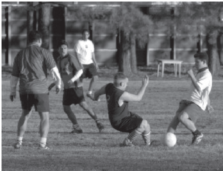
Soccer is the latest sport to join the interclub program as its popularity at Harding has increased significantly over the last few years.

Interclub competitions involve the following sports: softball, flag football, volleyball, basketball, swimming, track and field, and soccer.