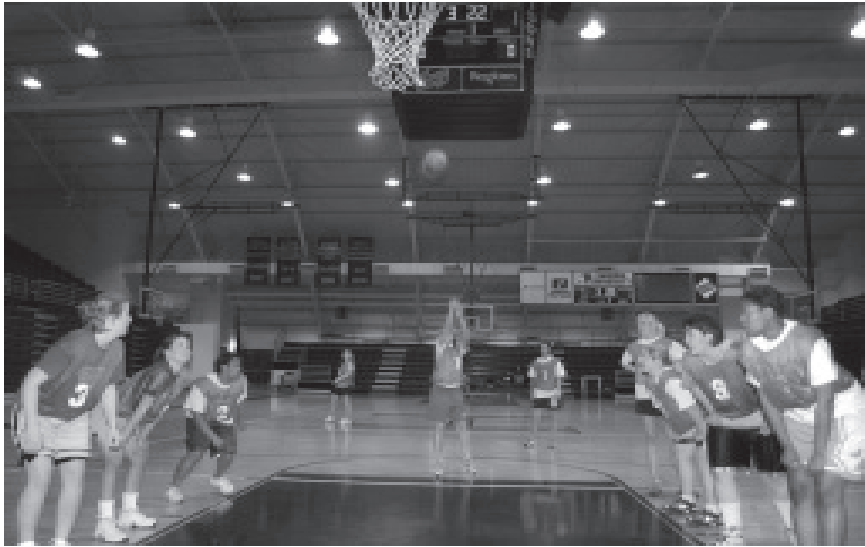
In both intramural and interclub tournaments, students enjoy the competition in basketball. Students of every level of skill are eligible to sign up to play in the intramural program.