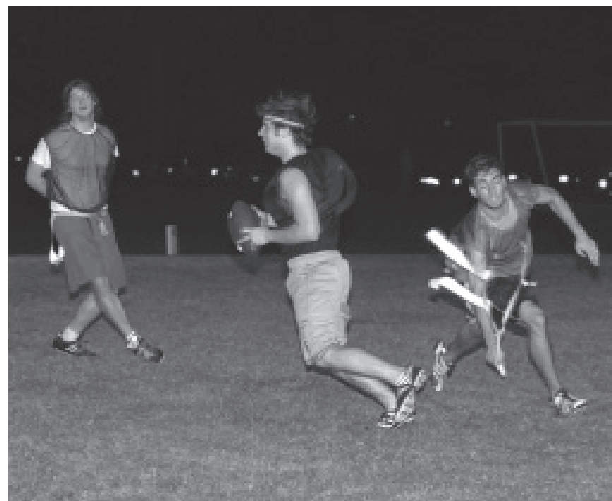
Noncontact flag football is a favorite event among men students who participate in intramural and interclub athletics at Harding. The tournament is played during the traditional fall football season.

To be eligible for this award, a student must be an undergraduate who has participated in at least 50 percent of the activities offered, given unselfishly of his time to officiate games, been a considerate spectator, and most of all, shown the spirit of fair play and good sportsmanship at all times.