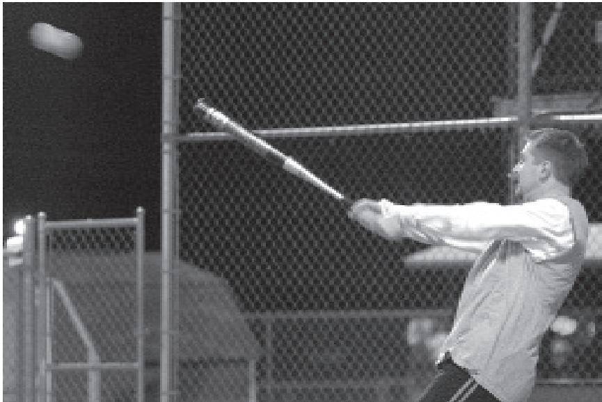
Intramural and interclub activities at Harding allow students to participate in a variety of sports without the pressure of intercollegiate competition.