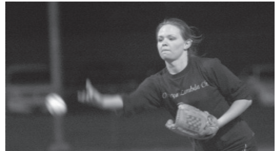
Softball is one of the more popular sports among students involved in both intramural and interclub athletics. Tournaments are held each fall and spring.

1. You must contact your opponent and schedule your match when it is convenient.