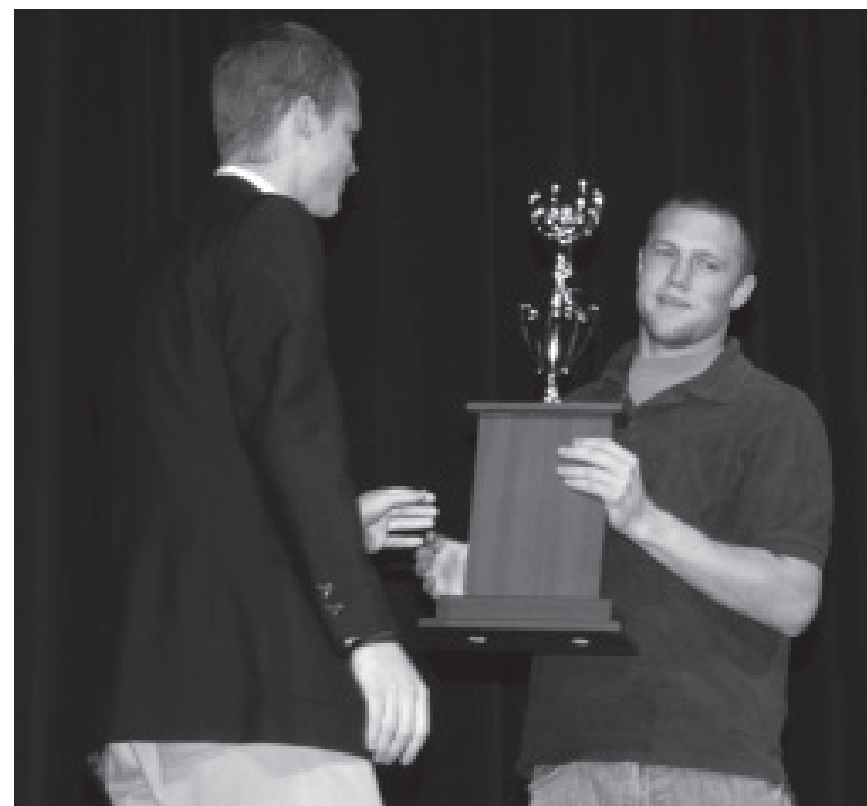
The Athlete of the Year is awarded to the individual who not only excels in intramural sports, but also receives a high ranking in Spirit Award balloting, combining athletic ability with good sportsmanship.

Archery – Contestants will shoot 24 arrows at a 20-yard distance from the target. The gross count for the arrows will be the contestant’s score. The maximum possible score is 216. Check the intramural bulletin board for the date to sign up for this event.