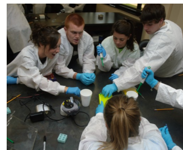
Pharmacy Campers involved in a hands-on forensics lab.