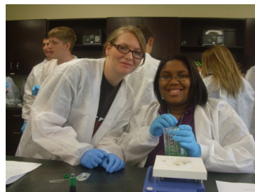
Campers "compounding" lollipops.

Pharmacy Camp 2011 is tentatively set for June 19-24. Applications will be available on the College of Pharmacy website after January 1, 2011, and the enrollment will be limited to 30.