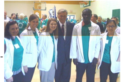
Four Harding College of Pharmacy students and one UAMS student with Governor Mike Beebe at the Mission of Mercy free dental clinic

All the patients were very appreciative of the dental care and medications. Several representatives from the Arkansas Dental Association stopped by to express their appreciation for our participation. It was good to be a part of this great outreach as well.