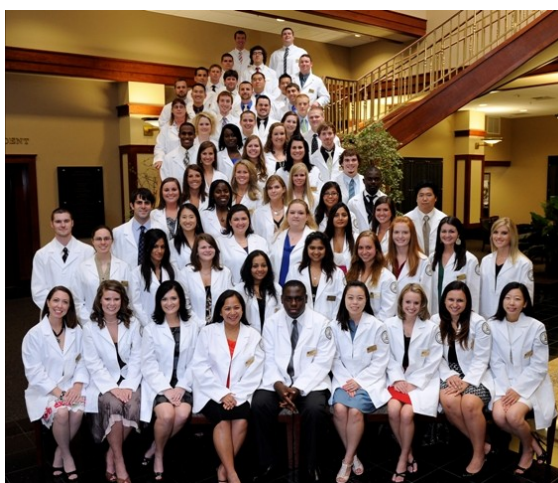
Class of 2014