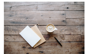
Write it down