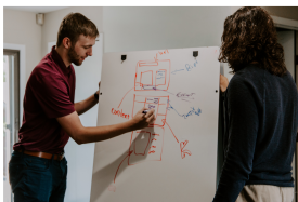
Draw a picture