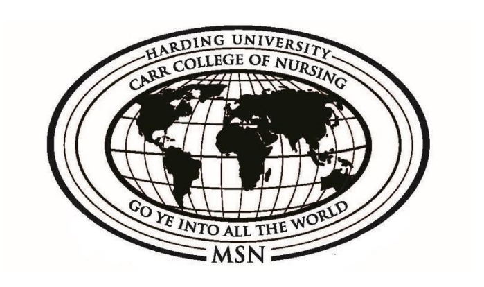
2023 and following

Presentation of the official Harding University Carr College of Nursing pin at the pinning ceremony began with the first BSN class (1977). The MSN pin will be presented to all MEPN graduates at the pinning and hooding ceremony representing their graduate degree. The Carr College of Nursing pin is part of the graduate's uniform and may be required by a clinical agency while the graduate is working for the agency. If the graduate's nursing pin is lost, the graduate may purchase another pin by directly contacting the MEPN Program Director in the Carr College of Nursing.